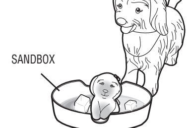
Color change by applying warm or cold water.

1) To color change: Dip puppy in icy cold water to reveal "mud" on puppy's face and (2) paws.